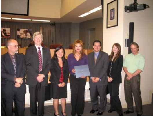
Picture taken at PC meeting where Exceptional Supervisor Certificate Program participants were honored.

The PC congratulated over 100 Classified employees for their recent accomplishments of completing one or both of the Exceptional Supervisor Certificate Programs. These programs offer training in the best-practices of supervision and prepare employees to serve at their best in a supervisory role.