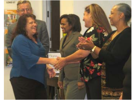
Picture taken at recent School Office Procedures Certificate Program Ceremony.

A second celebrated group of Classified employees was acknowledged for their completion of the School Office Procedures Certificate Program. This eight-session program provides “hands-on” procedures training for Classified employees that are either aspiring to become School Administrative Assistants (SAAs) or are new to the SAA role.